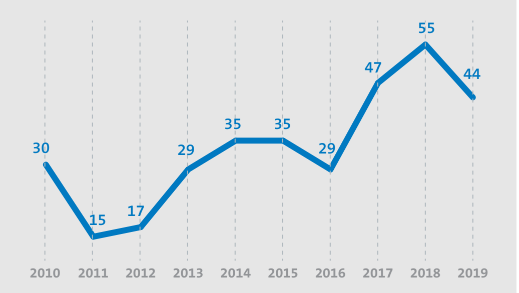
FIGURE 1 CLASS ACTION FILINGS