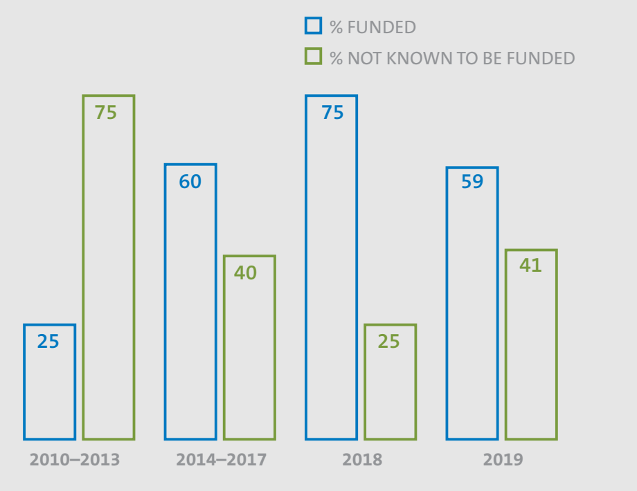
FIGURE 4 THIRD PARTY FUNDING