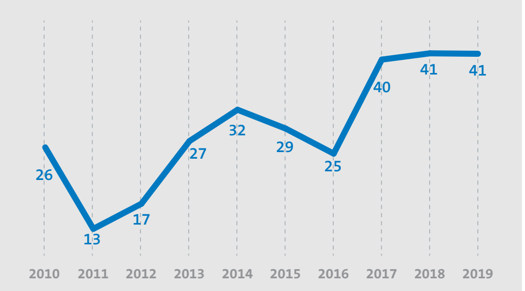
FIGURE 2 FILINGS WITH COMPETING CLAIMS EXCLUDED